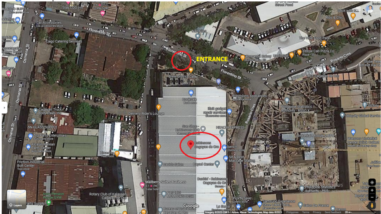
Imagery ©2023 CNES / Airbus, Maxar Technologies, Map data ©2023 20 m